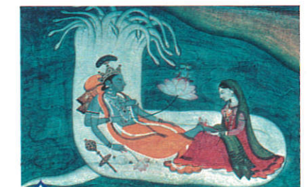
C There are several creation stories in Hinduism. Here Vishnu appears, resting on the great serpent ANANTA, floating on the cosmic ocean.