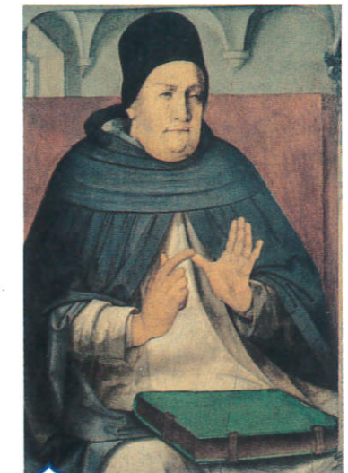
B St Thomas Aquinas (1225–1274)

Some people use the fact that we are able to measure time as evidence that the universe had a beginning, because to measure time we need a starting point. A theist would argue that the measurement of time is evidence that the universe had a beginning and that this beginning was caused by God.